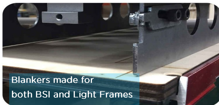
Blankers made for both BSI and Light Frames